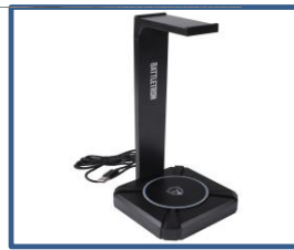
Foto del artículo Picture of the item

El objeto descrito se ajusta a la legislación pertinente de armonización de la Unión: